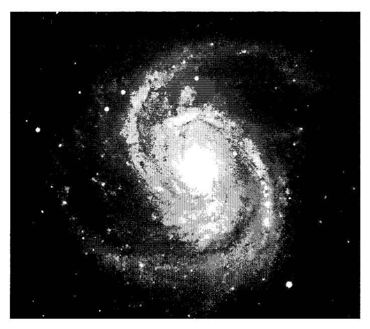
Fig. 2. Messier 100 indicates the design studio much better.

On the contrary the studio is a milieu where there is an ongoing whirlpool, or an ongoing boiling thing, or a black hole, that things enter so fast you can not even realize it, in a way it creates itself, but on the other hand it is a place where things come out from it, important things, ideas; a whirlpool constantly splashing out (Figure 2) (2).